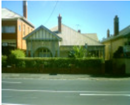
4 Aberdeen Street, Geelong West