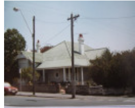
Aberdeen 10_1986 Study.JPG