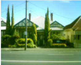
14 Aberdeen Street, Geelong West