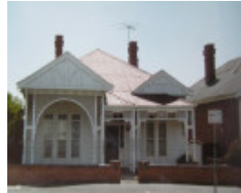
Aberdeen 14_1986 Study.JPG