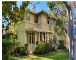
579 Toorak Road, TOORAK