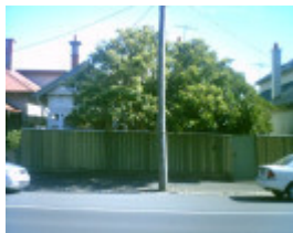
48 Aberdeen Street, Geelong West