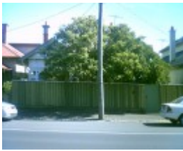
48 Aberdeen Street, Geelong West