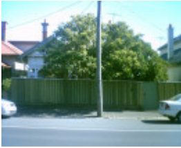
48 Aberdeen Street, Geelong West