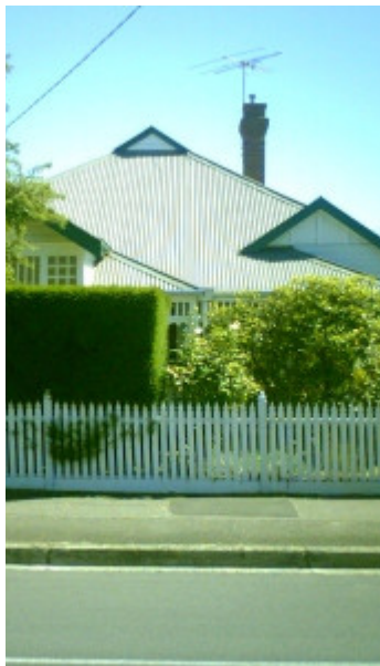
66 Aberdeen Street, Geelong West