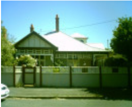
100 Aberdeen Street, Geelong West