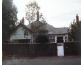
100 Aberdeen Street - 1986 Study