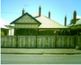
102 Aberdeen Street, Geelong West