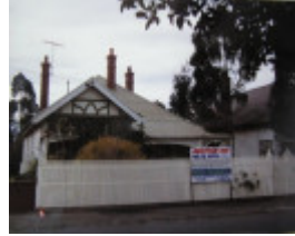
Aberdeen 102_1986 Study.JPG