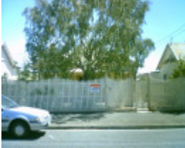
142 Aberdeen Street, Geelong West