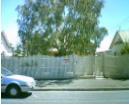
142 Aberdeen Street, Geelong West