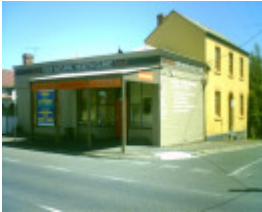
148 Aberdeen Street, Geelong West