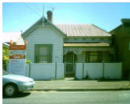
150 Aberdeen Street, Geelong West