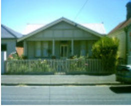
152 Aberdeen Street, Geelong West