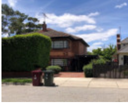
126 Elizabeth Street, Kooyong