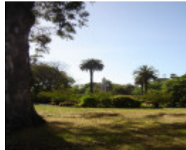
queen vic memorial distance view2 nov06 jb