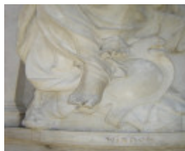
queen vic memorial damage nov06 jb