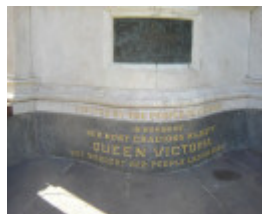
queen vic memorial dedication nov06 jb