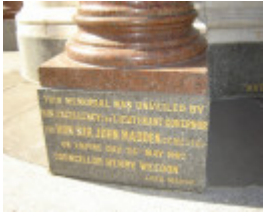
1535 queen vic memorial foundation stone nov06 jb