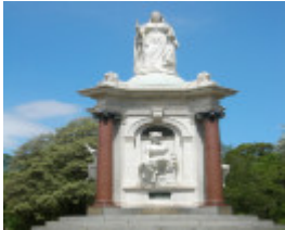
QUEEN VICTORIA MEMORIAL SOHE 2008