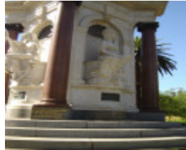
queen vic memorial front nov06 jb