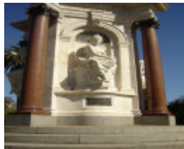
queen vic memorial marriage nov06 jb