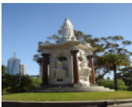
queen vic memorial rear view2 nov 06 jb