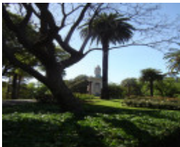
queen vic memorial distance view nov06 jb