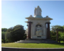
queen vic memorial front long view nov06 jb