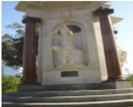
queen vic memorial birth nov06 jb