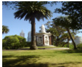
queen vic memorial rear view nov06 jb