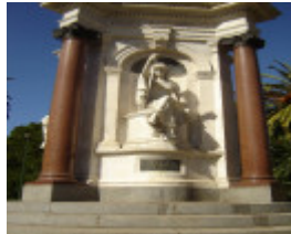
queen vic memorial death nov06 jb