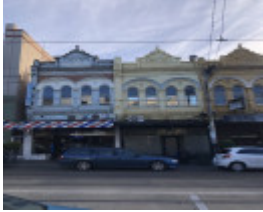
13 and 15 Glenferrie Road, Malvern