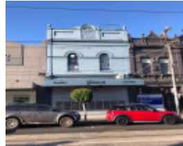
1212 High Street, Armadale