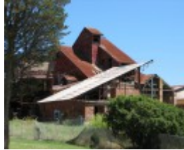
FORMER STANDARD BRICKWORKS SOHE 2008