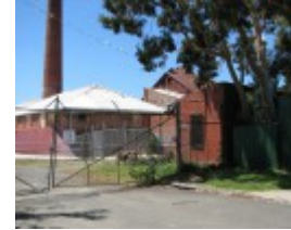
FORMER STANDARD BRICKWORKS SOHE 2008