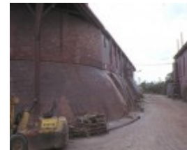
former standard brickworks federation street box hill side view kiln dec1987