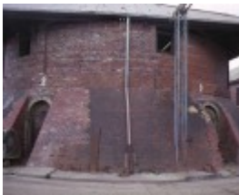
former standard brickworks federation street box hill end view kiln dec1987