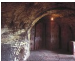
former standard brickworks federation street box hill vault dec1987