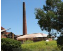
FORMER STANDARD BRICKWORKS SOHE 2008