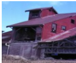
former standard brickworks federation street box hill red corrugated iron building