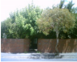
107 Autumn Street, Geelong West