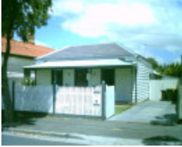
111 Autumn Street, Geelong West