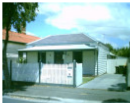
111 Autumn Street, Geelong West