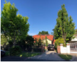
13 Harold Avenue, Glen Iris