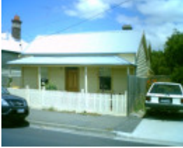
119 Autumn Street, Geelong West