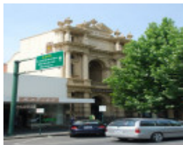
NATIONAL AUSTRALIA BANK SOHE 2008