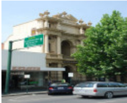
NATIONAL AUSTRALIA BANK SOHE 2008