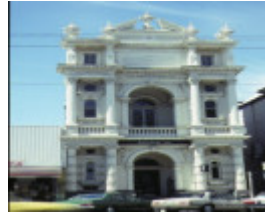
1 former colonial bank bendigo front view dec1993