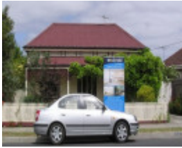
153 Autumn Street, Geelong West