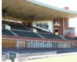
GLENFERRIE OVAL GRANDSTAND SOHE 2008