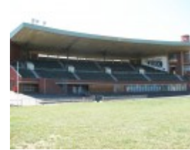
GLENFERRIE OVAL GRANDSTAND SOHE 2008