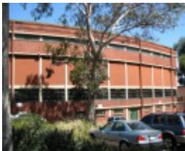
GLENFERRIE OVAL GRANDSTAND SOHE 2008