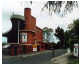
1 glenferrie oval grandstand linda crescent hawthorn side view