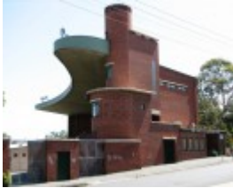
GLENFERRIE OVAL GRANDSTAND SOHE 2008