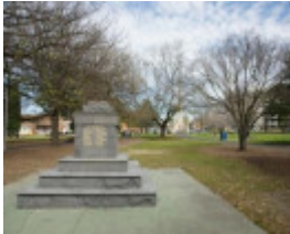
Essendon Boer War Memorial.jpg