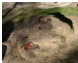
Memorial Plaques at the Heidelberg Repatriation Hospital.jpg