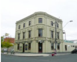
GOLDEN AGE HOTEL SOHE 2008