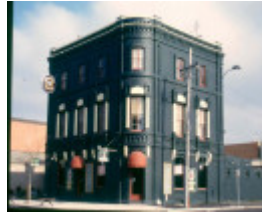
Golden Age Hotel Geelong Front