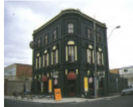
1 golden age hotel geelong front view apr 1997