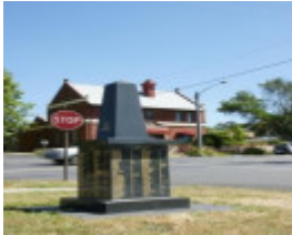
Loch Post Office War Memorial.jpg