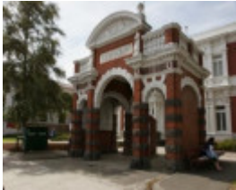
Preston Town Hall Memorial.jpg