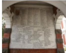
Preston Town Hall Interior.jpg