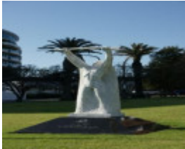
St Kilda Victoria Cross Memorial Sculpture.jpg