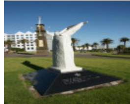
St Kilda Victoria Cross Memorial Sculpture 2.jpg