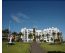
St Kilda Memorial Sculpture Alfred Square Gardens Esplanade.jpg