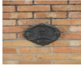
Stratford War Memorial Detail.jpg