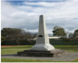
Stratford War Memorial.jpg