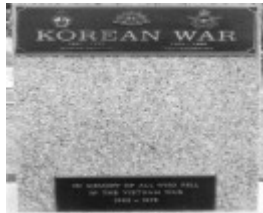
Wando Vale 5.jpg