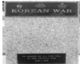
Wando Vale 5.jpg