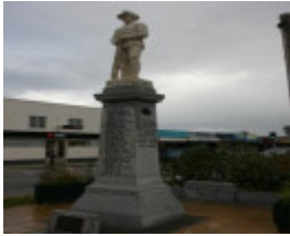
Yarram War Memorial Detail.jpg