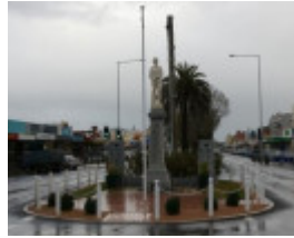
Yarram War Memorial.jpg