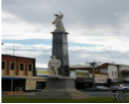
Yarrowonga War Memorial.jpg