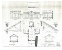
Bright court house architectural plan