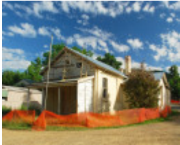
BRIGHT COURT HOUSE AND LOCK-UP SOHE 2008