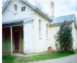
1 bright courthouse