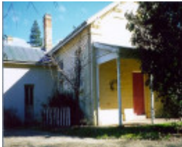
Bright Courthouse Front