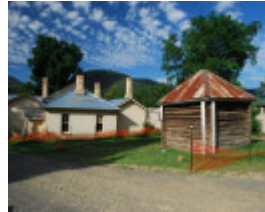
BRIGHT COURT HOUSE AND LOCK-UP SOHE 2008