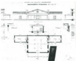
Bright court house architectural plan