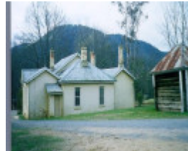
bright courthouse lockup