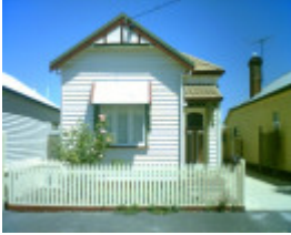
15 George Street, Geelong West