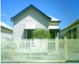
17 George Street, Geelong West