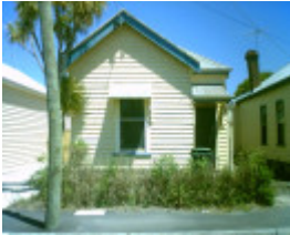
19 George Street, Geelong West