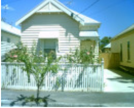
21 George Street, Geelong West