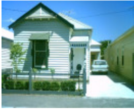
23 George Street, Geelong West