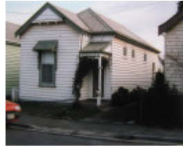
Source: Aitken, Honman & Huddle, 'City of Geelong West Urban Conservation Study', 1986.