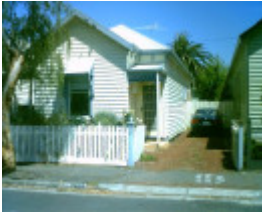
25 George Street, Geelong West