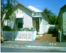
25 George Street, Geelong West