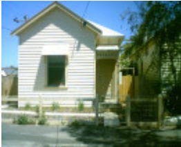
27 George Street, Geelong West