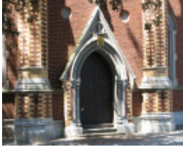
FORMER CONGREGATIONAL CHURCH SOHE 2008