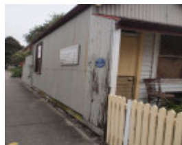
H0954 DOLLS HOUSE LHA 2015 2.JPG