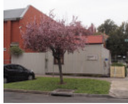
H0954 DOLLS HOUSE LHA 2015 1.JPG