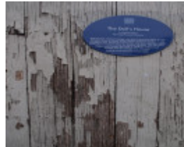
H0954 DOLLS HOUSE LHA 2015 3.JPG