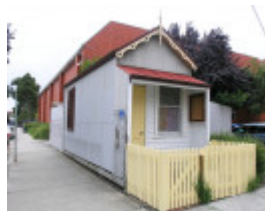
DOLLS HOUSE SOHE 2008