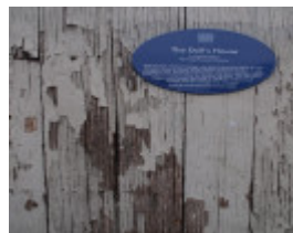
H0954 DOLLS HOUSE LHA 2015 3.JPG