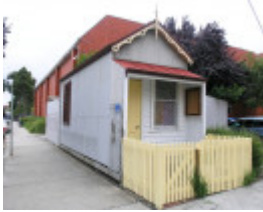
DOLLS HOUSE SOHE 2008