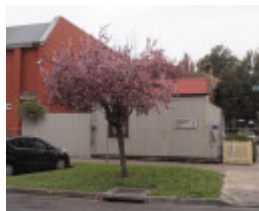
H0954 DOLLS HOUSE LHA 2015 1.JPG