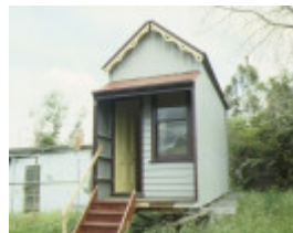
1 dolls house collingwood front view