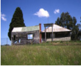
1 pontville yarra valley metropolitan park templestowe rear view nov1996