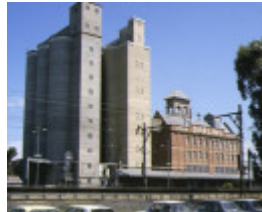
1 john darling & son flour mill albion view from railway line