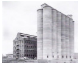
c 1940 depicting the south-west facade of the complex including the 1926-7 storehouse and mill building and the 1939 reinforced concrete silos