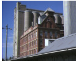
john darling & son flour mill albion silos