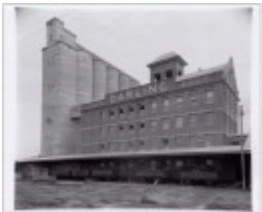
c 1940 depicting the east facade of the complex including the 1926-7 mill building rail siding loading platform canopy and rail cars and the 1939 concrete silos