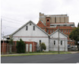
JOHN DARLING AND SON FLOUR MILL SOHE 2008