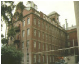
john darling & son flour mill albion front view