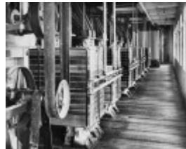
c 1948 copy of negative of an image showing the John Darling Flour Mill's pan-sifter floor