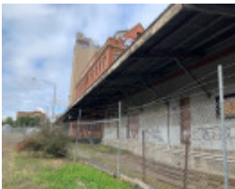
2021 John Darling and Son Flour Mill 2