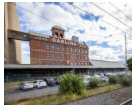
2021 John Darling and Son Flour Mill 1