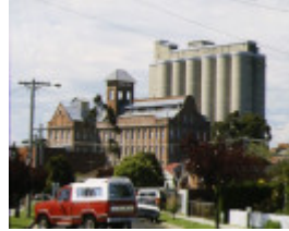
john darling & son flour mill albion view of property