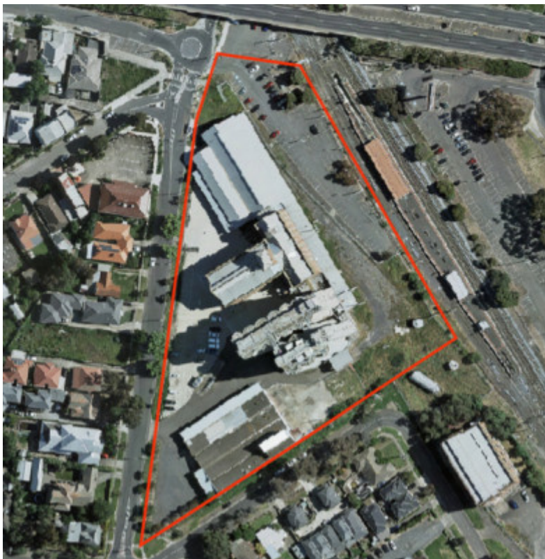
2021 John Darling and Son Flour Mill aerial diagram jpg