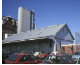
john darling & son flour mill albion delivery building