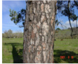
T11920 Pinus sylvestris