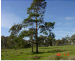
T11920 Pinus sylvestris