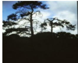
T11920 Pinus sylvestris