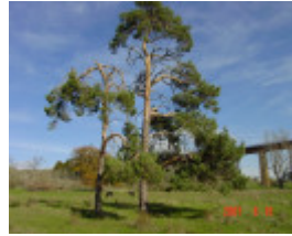
T11920 Pinus sylvestris