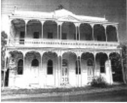
Long Gully Ironbark Comm Res Precinct 5 Gold Mines Hotel.jpg