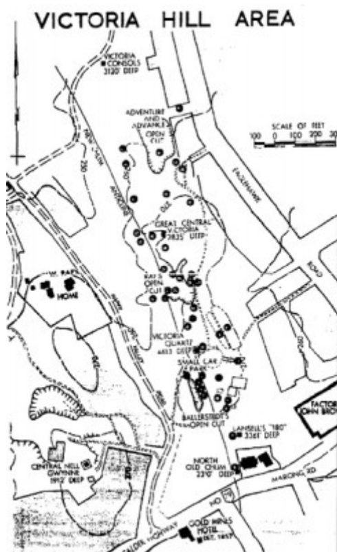
Long Gully Ironbark Comm Res Precinct 5 Victoria Hill Area Map 2.jpg