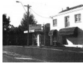
Long Gully Ironbark Comm Res Precinct 5.1 Ironbark Township.jpg