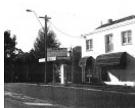
Long Gully Ironbark Comm Res Precinct 5.1 Ironbark Township.jpg