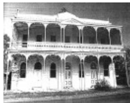
Long Gully Ironbark Comm Res Precinct 5 Gold Mines Hotel.jpg