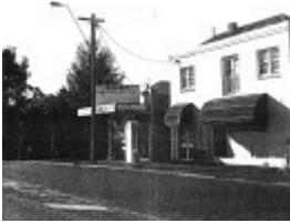
Long Gully Ironbark Comm Res Precinct 5.1 Ironbark Township.jpg