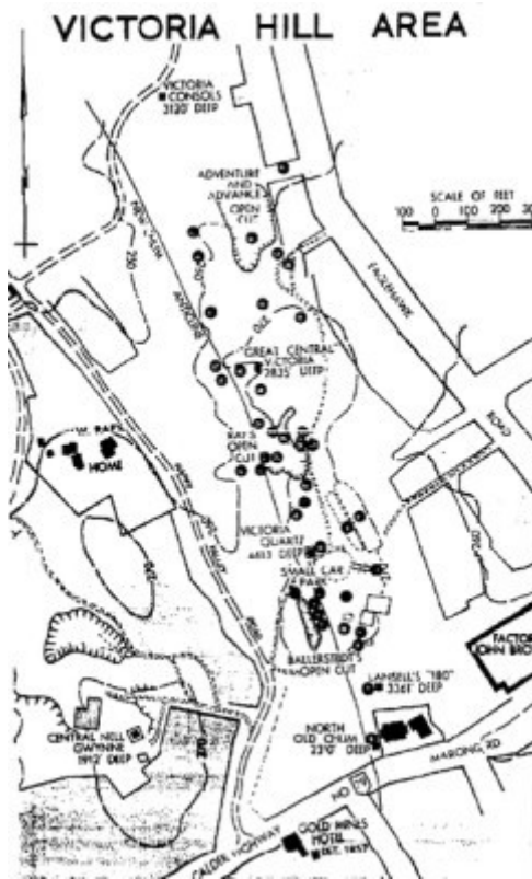
Long Gully Ironbark Comm Res Precinct 5 Victoria Hill Area Map 2.jpg