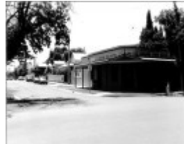
King Street from Myrtle Street